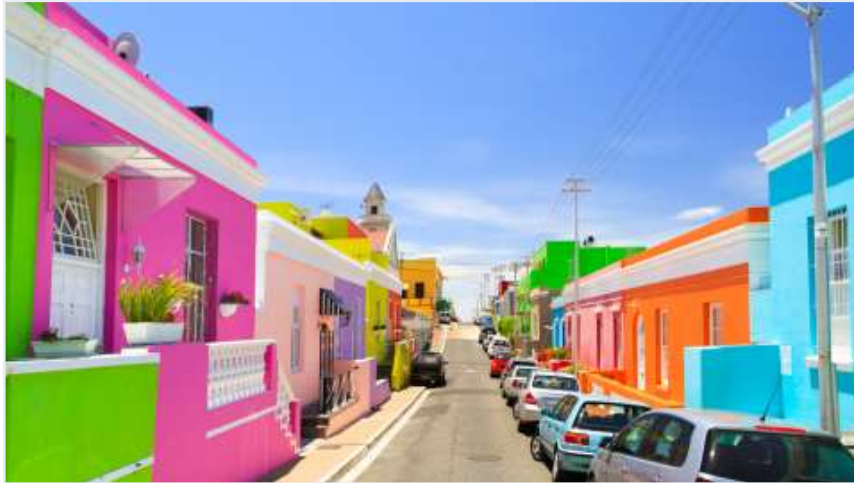
TABLE MOUNTAIN CABLE CAR EXPERIENCE (FAST TRACK CABLE CAR), BO-KAAP & GREENMARKET SQUARE, CASTLE OF GOOD HOPE, CAPE TOWN CITY SIGHTSEEING MEALS: BREAKFAST