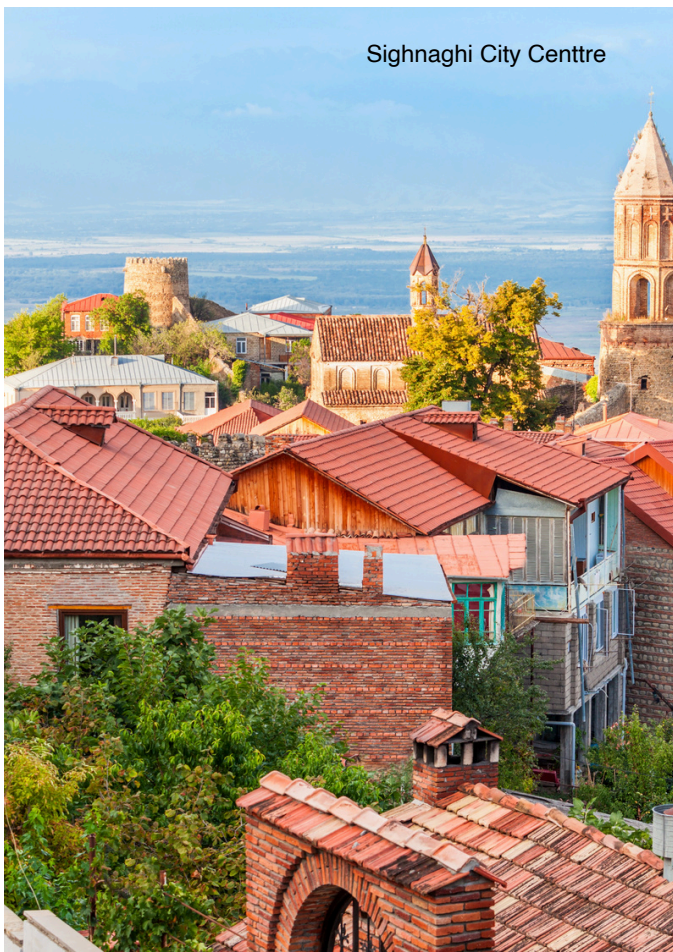
Sighnaghi City Centre