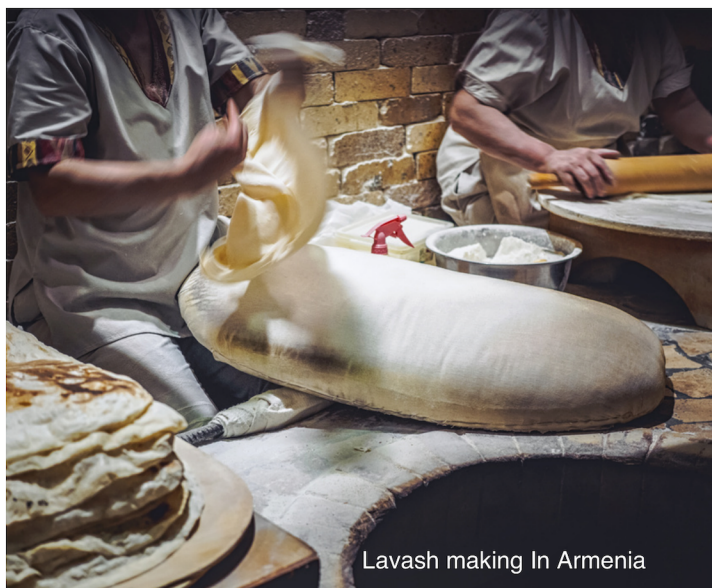
Lavash making in Armenia